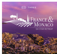
6 STAR TRIP 2025 France & Monaco

Multiple ways to earn this trip! Check out the flyer for full details!